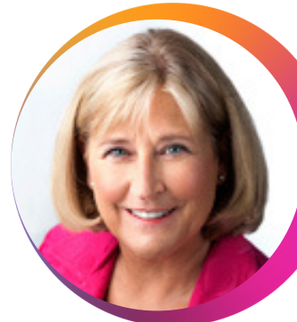
Becky Bailey, PhD

We have all been pushed to the edge of our resilience and many have been tossed beyond what their nervous system can tolerate. Join me as we explore the 3 Super Powers we all need to move beyond surviving to thriving as we reinvent education equitably for the whole adult and the whole child.